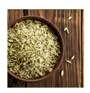
Fernel Seed Ferugreek