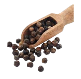
Glack Pepper Cardamom