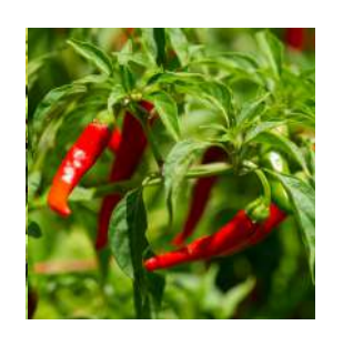
Cayerne Pepper Cinnamon