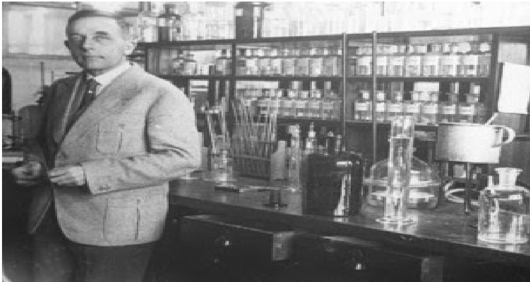
Dr Otto Heinrich Warburg In Berlin Laboratory

Dr Otto Heinrich Warburg from a lecture delivered by Otto personally at the 1966 annual meeting of Nobelists at Lindau, Germany: