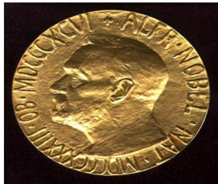
The Nobel Peace Prize

While Warburg continued to develop this outlook experimentally, holding several prominent lectures outlining the data, Otto proposed that some cancer cells switch over to a route which is oxygen-free called the glycolytic pathway. Interestingly, the cancer cells continue to use this conduit even when access to oxygen is restored. Though Warburg’s proposal has since been confirmed, the role played by glycolysis in cancer has been largely ignored.